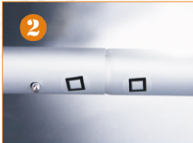
2. Take out the frame from the case, then connect the tube one by one with the same shape