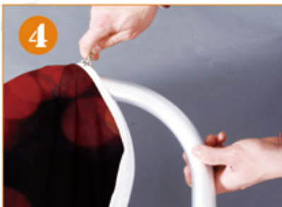
4. Cover the frame