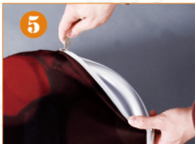
5. Close the zipper