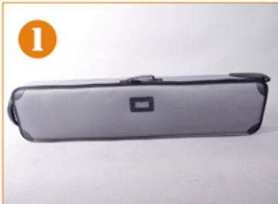
1. Carry bag with stand